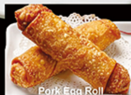
Pork Egg Roll