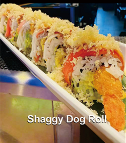
Shaggy Dog Roll