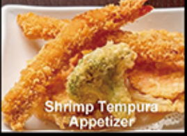
Shrimp Tempura Appetizer