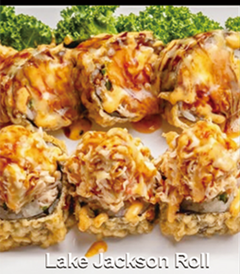
Lake Jackson Roll