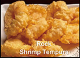
Rock Shrimp Tempura