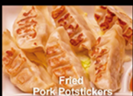
Fried Pork Potstickers