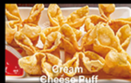
Cream Cheese Puff