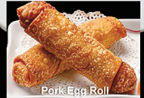
Pork Egg Roll