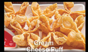
Cream Cheese Puff