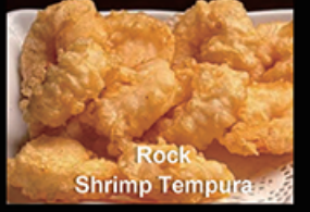
Rock Shrimp Tempura