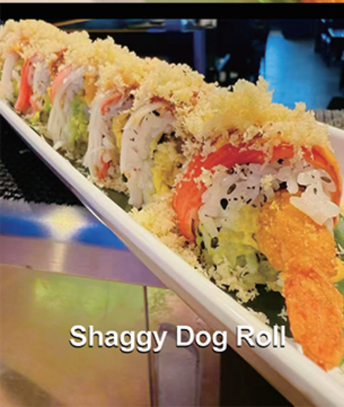
Shaggy Dog Roll