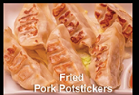
Fried Pork Potstickers