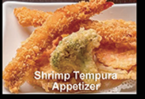
Shrimp Tempura Appetizer